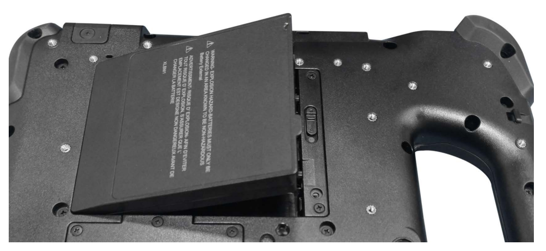
Figure 4 Battery Replacement

2. Press the battery down until it snaps into place.